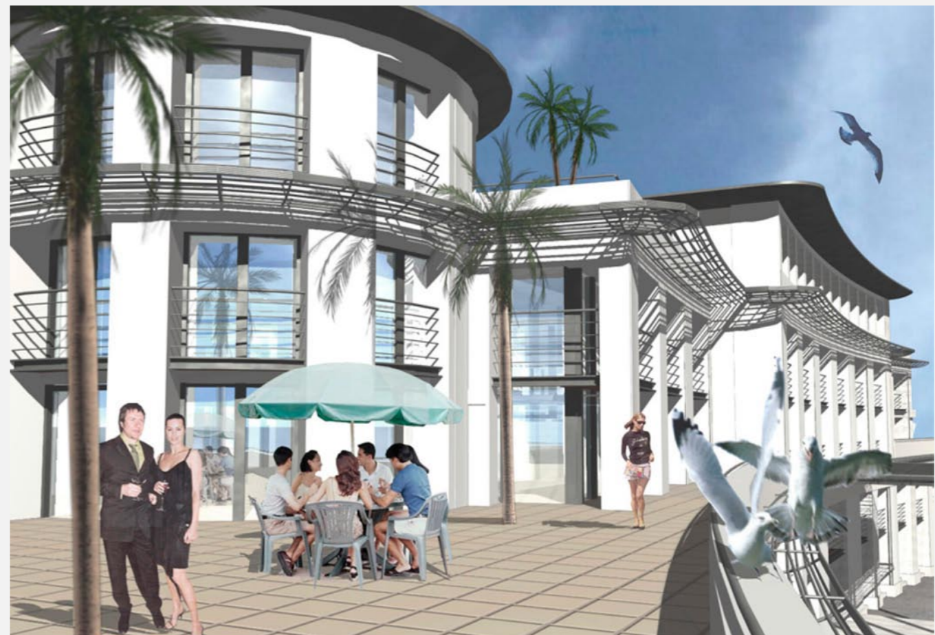
View of Patio Area