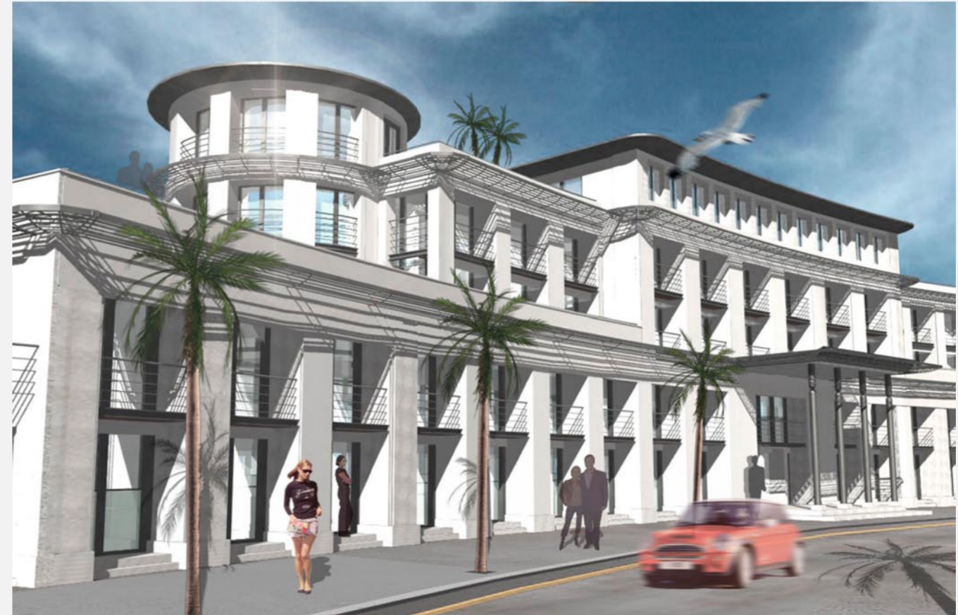
View of Main Entrance